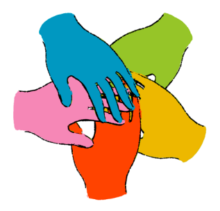
CONNECT We build partnerships with governments and universities.